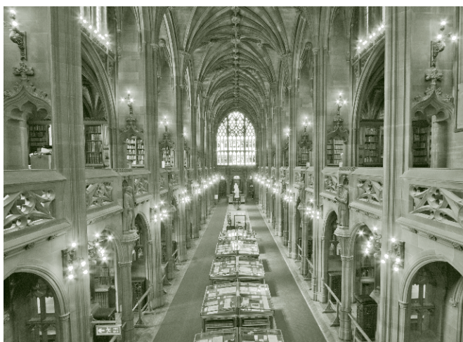
The rich historical legacy of the great Mancunian libraries...